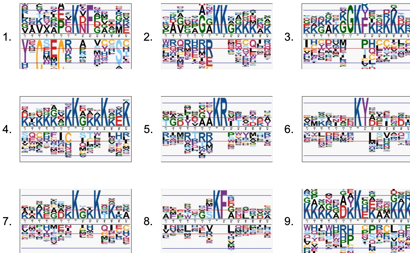
FIG. 4. Human acetylation motifs and their corresponding sequence logos extracted from the PhosphoSite database. The database contained 2,962 unique actual acetylation sites. Running motif-x on these sites results in a deconvolution of the data into eight motif groups plus a residual motif (group 9). Sequence logos in which the heights of the residues are approximately proportional to their binomial probabilities are shown for each corresponding motif. The residual motif group contains all of those sites that were not able to fall into one of the other motif classes and from which another significant motif could not be found (see “Experimental Procedures”).

unique sites for the tyrosine phosphorylation and lysine acetylation data sets, respectively), the number of motifs extracted was relatively small compared with comparably sized serine and threonine phosphorylation data sets. Second, the extracted motifs from these data sets also revealed a lack of specificity ( i.e. contained fewer fixed positions) compared with the serine and threonine phosphorylation results. Finally the proportion of sequences that could not be deconvoluted into a motif class (which is referred to as the residual) was substantially higher in the tyrosine phosphorylation and lysine acetylation data sets compared with the serine and threonine